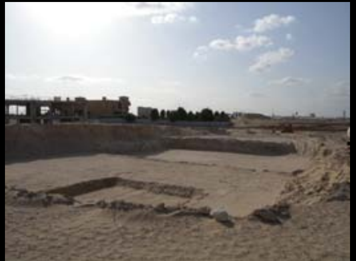
Plot No. 1.37-6655821