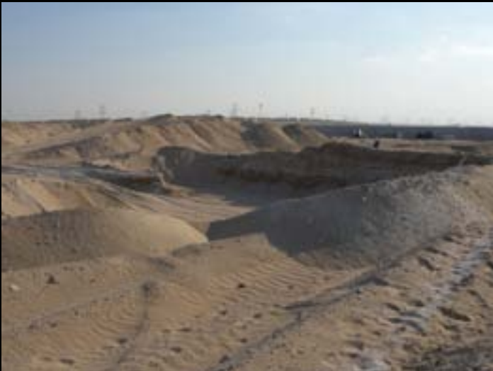
Plot No. 1.45-6655829