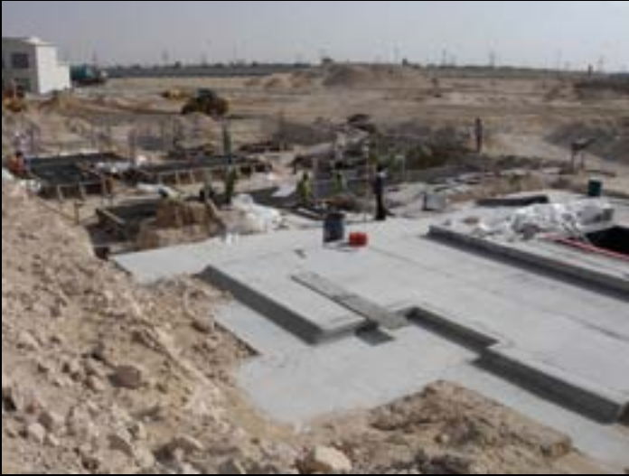
Plot No. 1.20-6655791