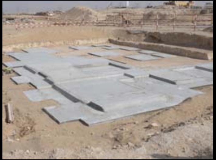
Plot No. 1.11-6655810