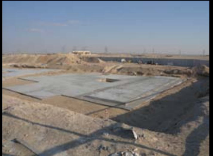
Plot No. 1.47-6655796