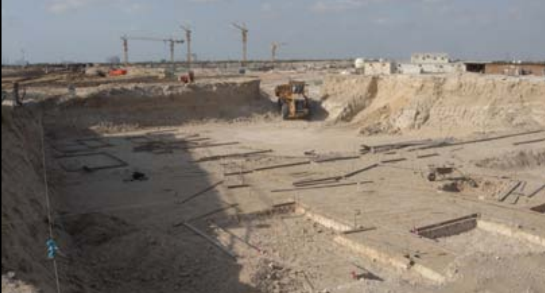
Plot No. 1.43-6655831