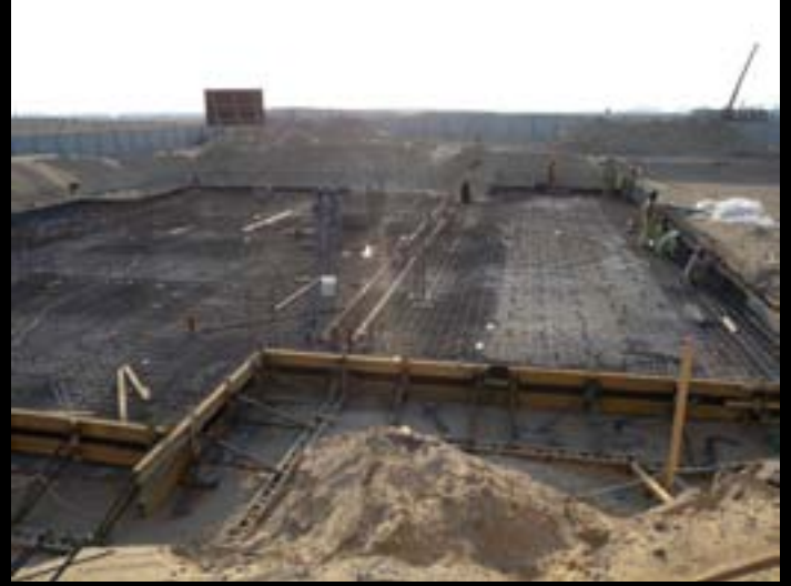
Plot No. 2.7-6655779