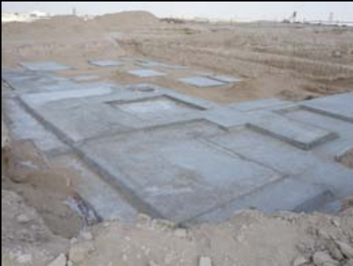
Plot No. 1.9-6655808