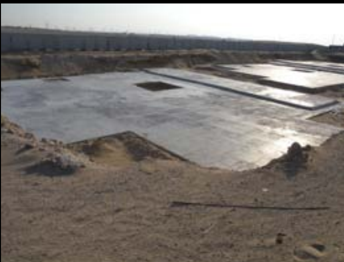
Plot No. 1.49-6655794