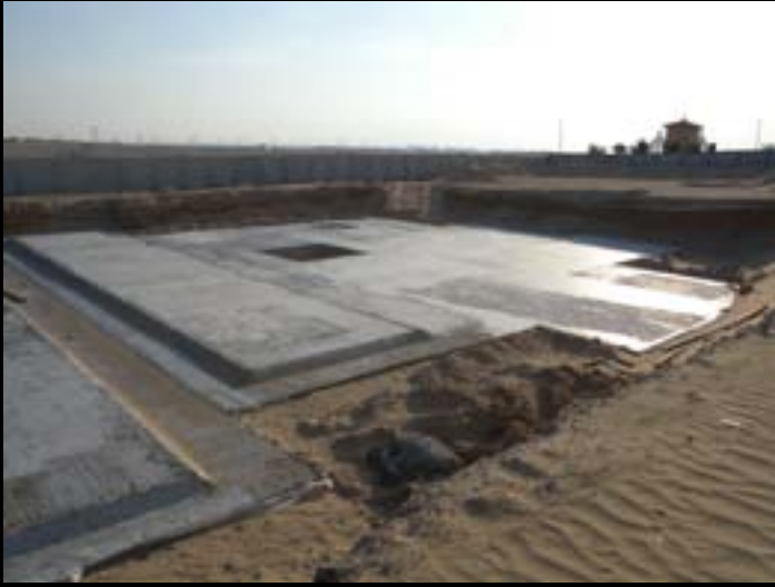
Plot No. 1.51-6655792