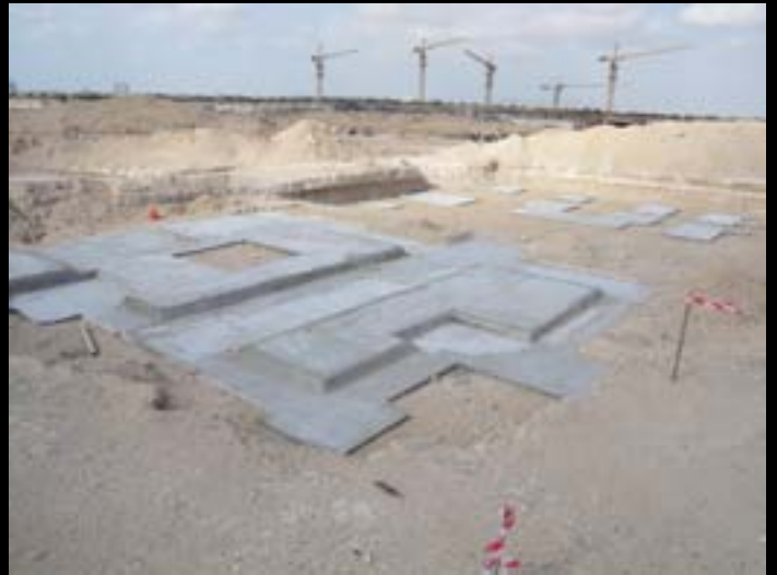
Plot No. 1.14-6655819