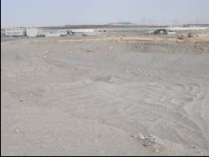
Plot No. 1.18-6655815