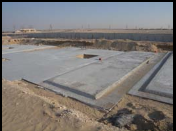
Plot No. 1.50-6655793