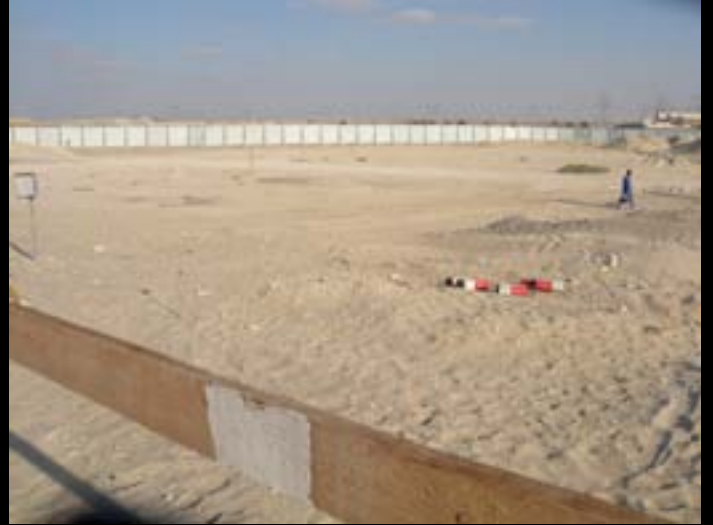
Plot No. 1.44-6655830