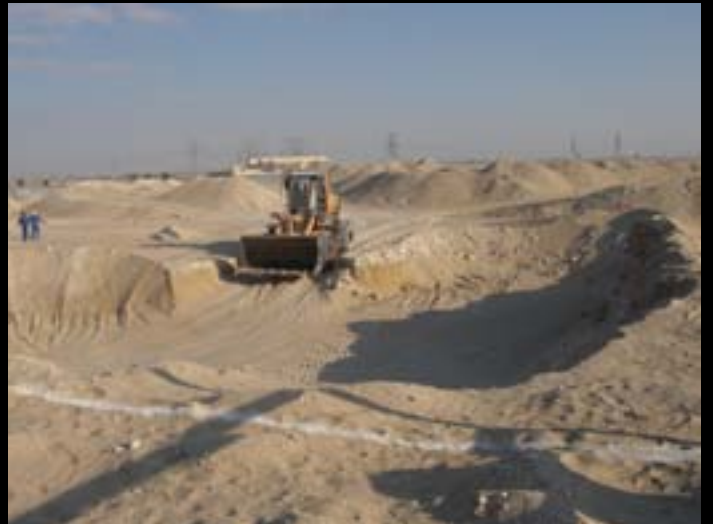
Plot No. 1.48-6655795