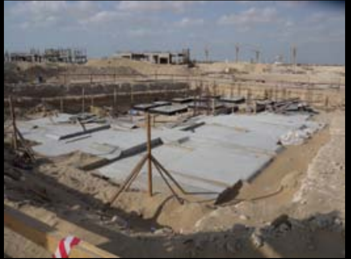
Plot No. 1.26-6655781