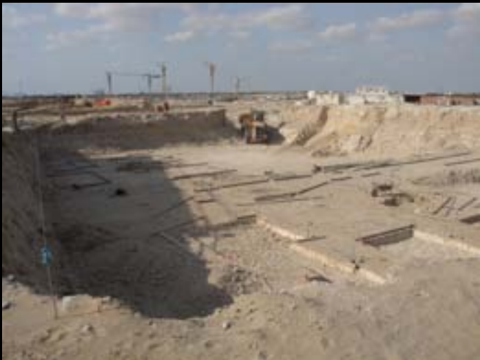
Plot No. 1.36-6655821